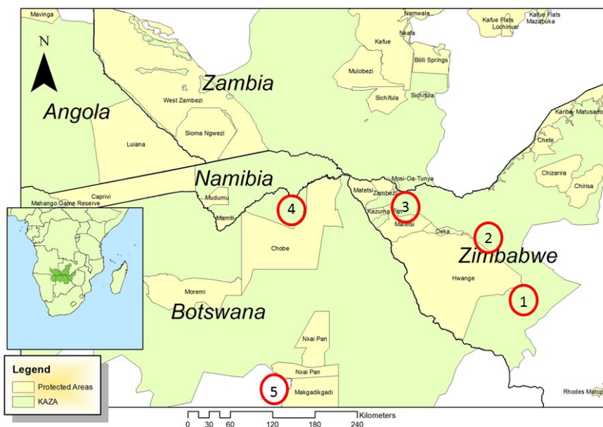
Map of study sites.

Western Zimbabwe and north-eastern Botswana are agriculturally marginal, with poor soils and rainfall (see map of project sites below). However, livelihoods in rural communities rely precariously on subsistence agriculture, especially crop growing and livestock ownership with median household owning 6-10 cattle and 6-10 sheep or goats (data collected through sociological survey during Darwin Initiative project, Research Ethics Committee Reference No. R53944/RE001). Traditionally women bear the burden of land clearance and cultivation with limited access to inputs such as fertiliser or mechanisation. Crop failure in poor years often results in chronic malnutrition, particularly affecting households with no alternative incomes; frequently those headed by women. Poverty increases reliance on natural resources, leading to unsustainable, illegal or commercial utilisation of resources such as wood, wildlife products and bush-meat. Simple improvements to cropping methods greatly improve yields and food security, and reduce land and labour requirements and environmental damage.